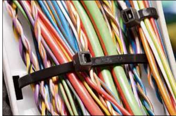
Standard T-Series cable ties – for almost any type of application (PA66).