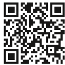
One Step to the Web!