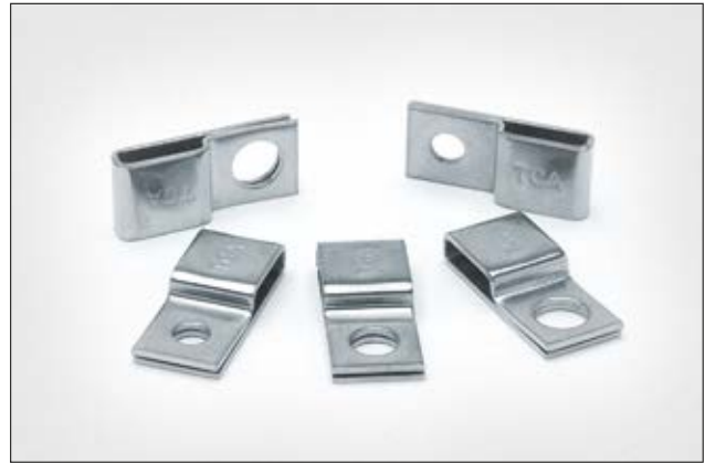
Stainless Steel P-Mount SSPC for use in arduous environments.

i The SSPC-Mounts can ideally be combined with the MBT cable ties on page 86–92 and with the MST and MLT cable ties on page 93, 94.